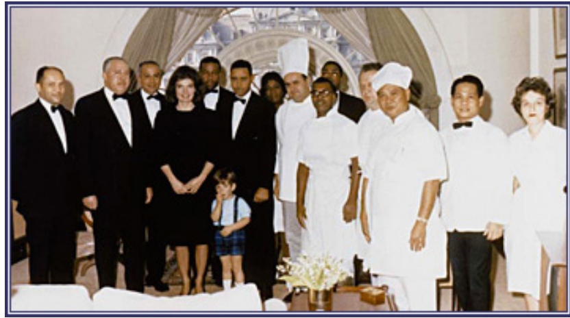
Jacqueline Kennedy with her son and members of the White House household staff.

This was not the executive aides and advisers, the secretaries and typists who ran the public lives of a President and First Lady.