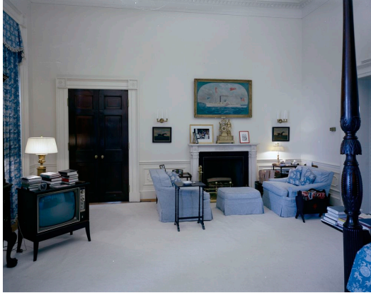
President Kennedy's bedroom; behind the door at left on bookshelves was a hi-fi set where Jackie Kennedy said JFK liked to play the record album from the Broadway musical Camelot.