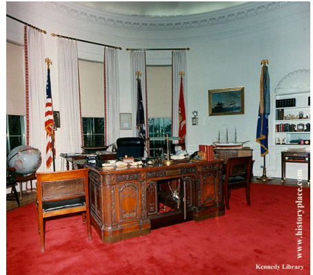
The redone JFK Oval Office never seen by either Kennedy.

Not until two years into his presidency, after she had refurnished the family quarters and state rooms, did Jackie Kennedy begin redecorating the Oval Office. The renovation was completed while the Kennedys were in Texas. On the morning of November 23, just hours after Jackie Kennedy had returned to the White House with the late President's flag-draped coffin, she went there to see how it looked, and to also remove personal items from the drawers of her husband's desk there.