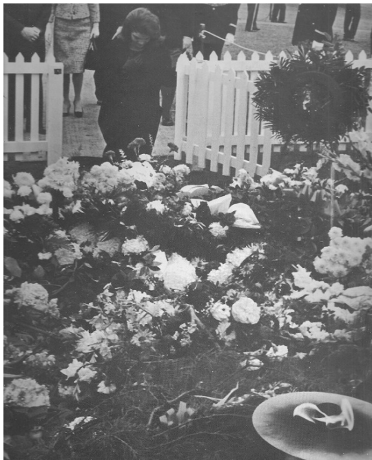
The President's widow came to kneel in prayer at JFK's burial place, illuminated by the eternal flame. (LC)

And so they returned to Arlington National Cemetery , the night black and cold, the crowds gone but for the sentries.