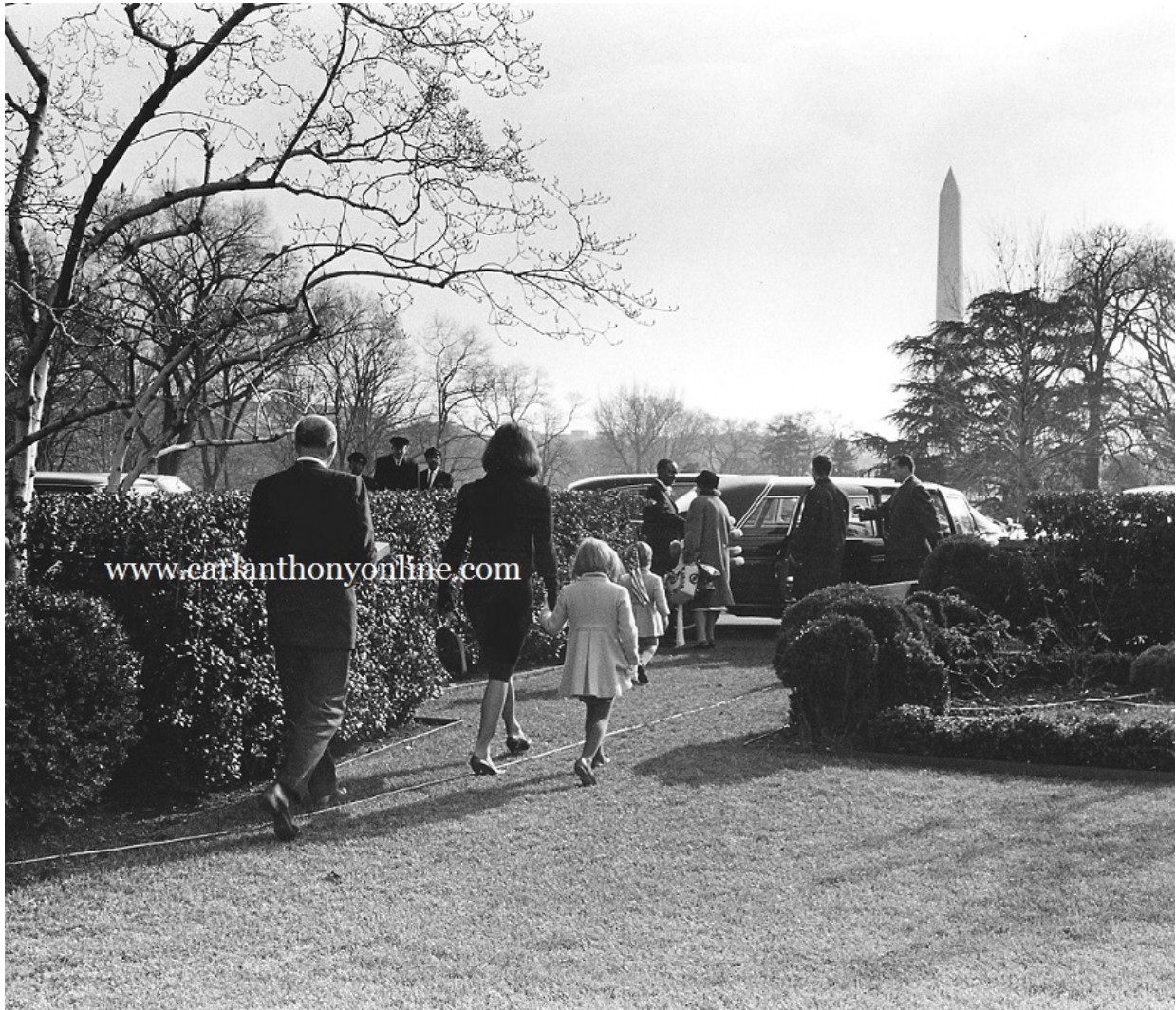
Jacqueline Kennedy and her children walk towards their car, leaving behind their life in the White House.