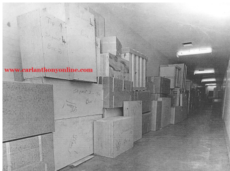
The Kennedy family possessions ready to be shipped out of the White House.

Presidential aides throughout the White House complex, from the West to the East Wing, the Executive Office Building to the Executive Residence were often choked with emotion, however, at the sight of crates and boxes which now began to clog the hallways, packed with the assassinated President's office papers, personal and other items.