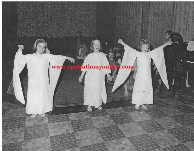
Caroline Kennedy in her White House school Christmas Pageant, December 16, 1963 in the movie theater.