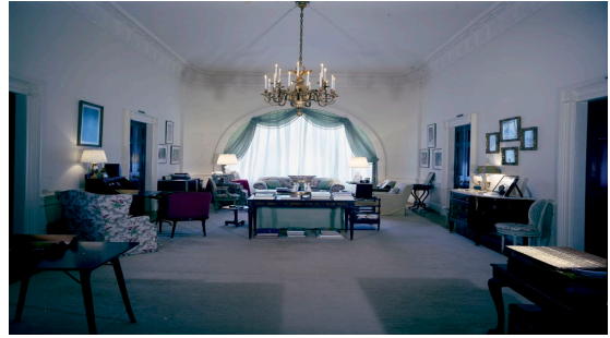
The West Sitting Hall of the Kennedy White House.

The Center Hall and the West Sitting Hall were lined with cardboard boxes and wood crates, as Jackie Kennedy oversaw domestic staff members and friends who helped her through the process of packing.