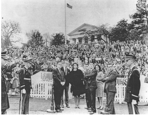
Just before leaving for Thanksgiving, Jackie Kennedy visited her husband's gravesite on November 28, 1963.

Three days after JFK's burial was Thanksgiving. Before leaving for their Hyannis home, the widowed First Lady went again to visit her late husband's grave, accompanied by Bobby Kennedy , her sister Lee Radziwill, and others. By now, a small wood picket fence had been built around the grave, where it was piled high with floral tributes. Despite the onlooking public crowds, she knelt there in prayer.