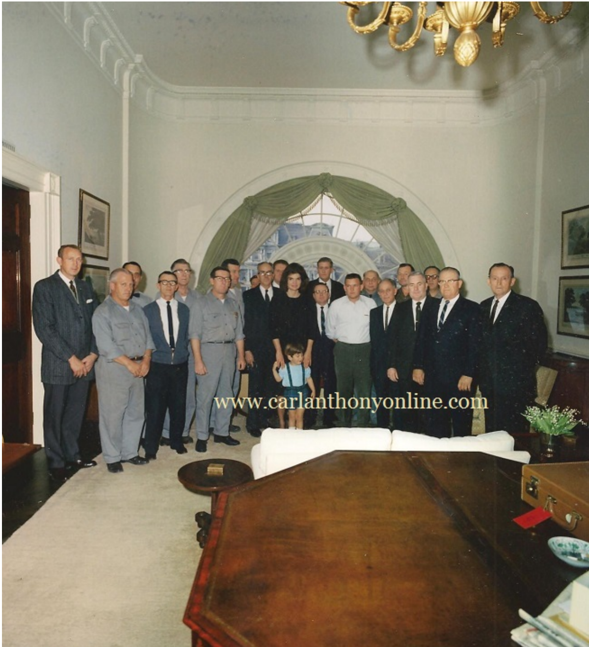
Mrs. Kennedy poses with the White House maintenance staff.

She then proceeded downstairs to the East Room to watch, from behind a screen, as President Johnson made the first presentations of the new Presidential Medals of Freedom, which the President and Mrs. Kennedy had worked on re-designing together. One was awarded to the late President.