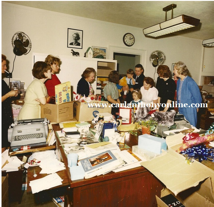
Before they left their home in the White House, the Kennedy children were permitted to chose one Christmas gift each from among the thousands sent from the public.