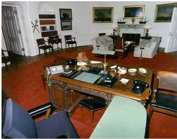
The Kennedy Oval Office, redecorated to the First Lady's specifications while they were in Texas but dismantled before she returned and could see it.

Sadly for her, it was already being disassembled, returned to a bare appearance in order for the new President to create the space according to his own wishes.