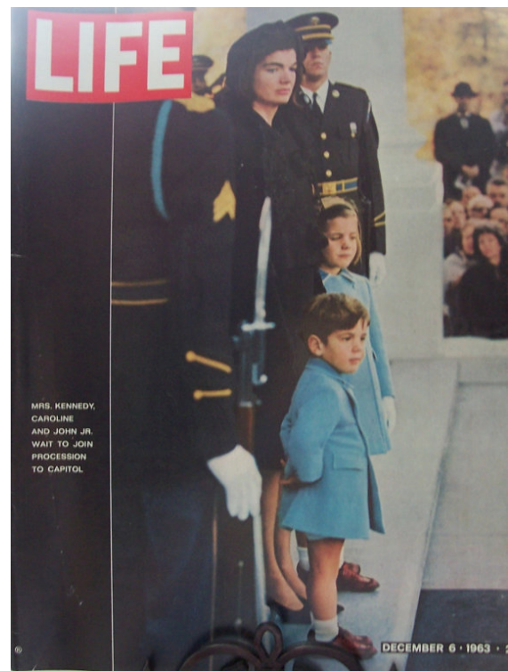
The December 6, 1963 issue of Life magazine in which Jacqueline Kennedy first drew the analogy between the mythic Camelot kingdom from the popular Broadway musical and her husband's presidency.

In remarking how he often liked to play the phonograph record of the Broadway musical Camelot and loved the show's title song, she made the implicit comparison between the mythic kingdom and his own presidential Administration.