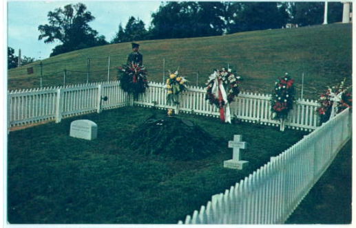
The temporary Kennedy gravesite.

Just hours after she had been handed the flag which covered the President's coffin and left his intended final resting place following the burial service, and once all the friends, family, and heads of state had left the White House reception, the widowed Jacqueline Kennedy quickly accepted the impromptu invitation from his brother, Attorney General Robert Kennedy to visit "our friend."