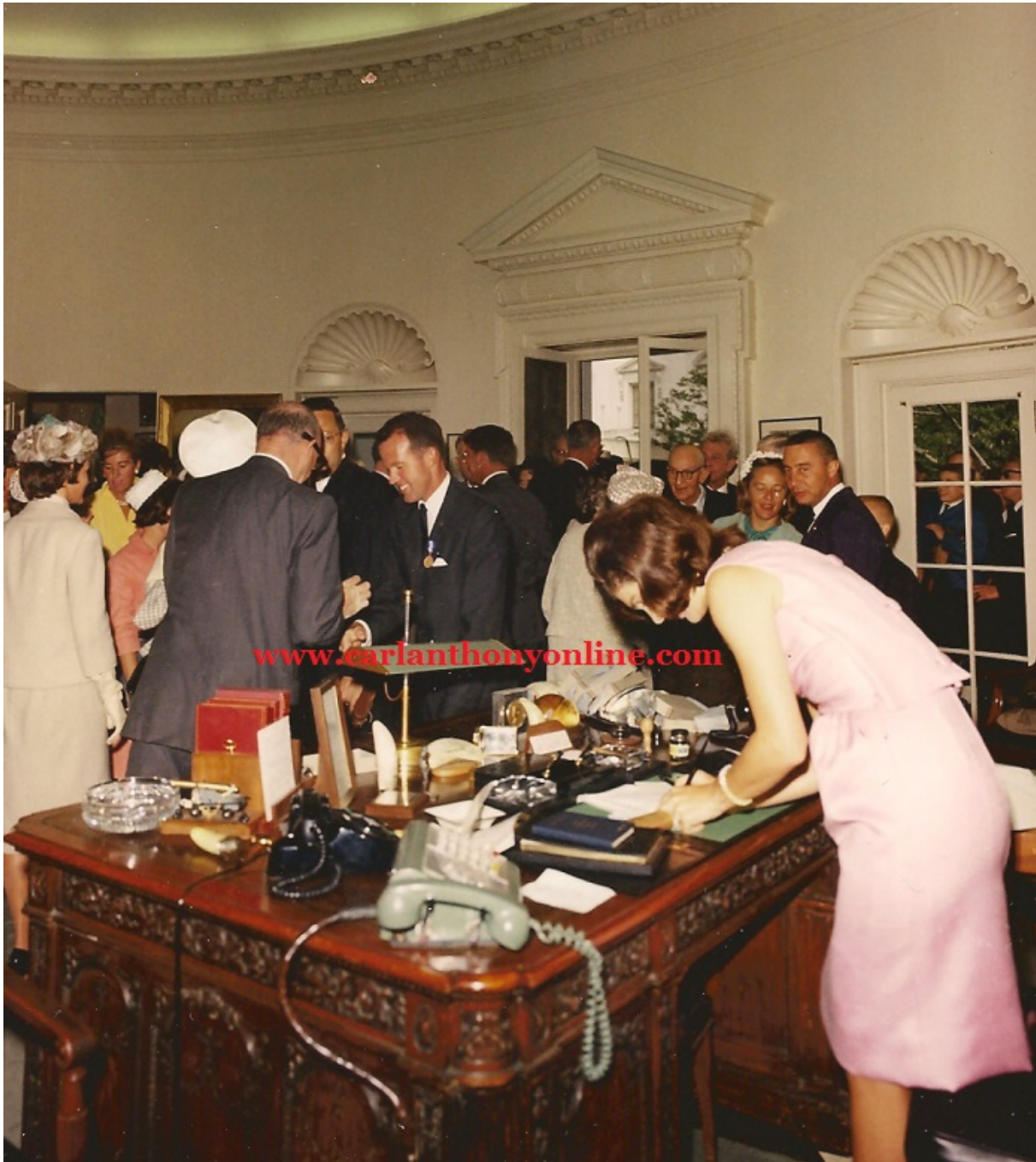
Jacqueline Kennedy writing on the President's Oval Office desk in the spring of 1963.

BY CARLANTHONYONLINE.COM on DECEMBER 6, 2013