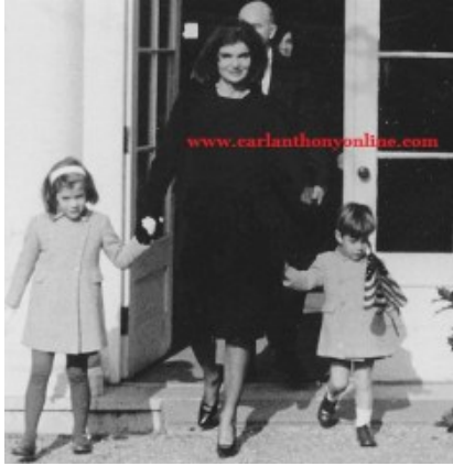
Jacqueline Kennedy exits the White House with her children.

Before the room's guests filed out, Jackie slipped from the room, down the Cross Hall to the family elevator and went down to the ground floor.