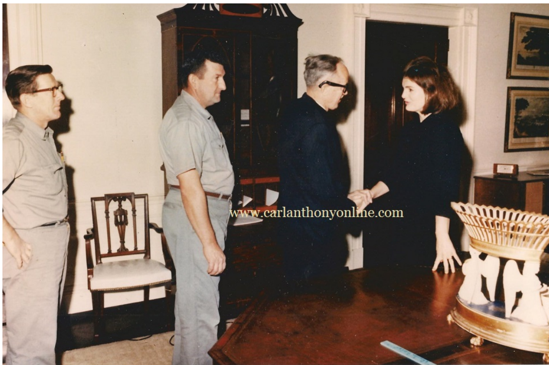
Jackie Kennedy greets household staff members one last time.

On her last night in what was now a lonely house for her, Jackie Kennedy wrote a sympathy letter to the widow of Dallas policeman who had come upon Lee Harvey Oswald and was also shot and killed by him.