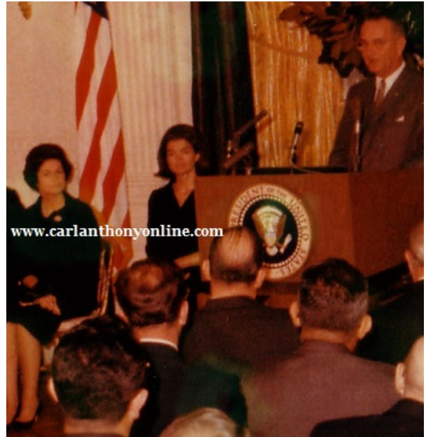
Jacqueline Kennedy attending LBJ's speech to Alliance for Progress Latin American representatives.

For Jacqueline Kennedy, this proved upsetting for an unexpected reason.