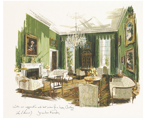
The 1963 Green Room rendering which was distributed as a gift print to staff but not sent out in Christmas card form.

Although the White House had not yet begun mailing the 1963 Kennedy Christmas card, Jackie did have distributed the gift prints of the same image, a color rendering of the Green Room.