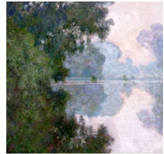
Morning on the Seine by Claude Monet was donated to the White House by the Kennedy family in memorium to him.

There, Eunice Kennedy Shriver kept her gaze steady on a landscape by Claude Monet entitled Morning on the Seine.