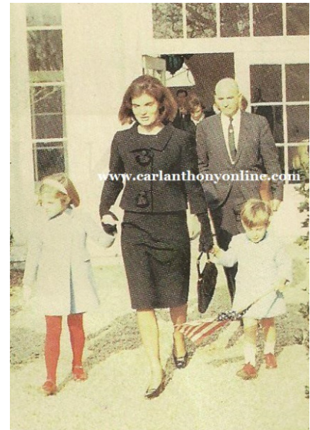
The remaining Kennedy family exiting the White House.

“I wish you a happy arrival in your new house, Lady Bird,” Jacqueline Kennedy wrote her, “Remember – you will be happy here.”